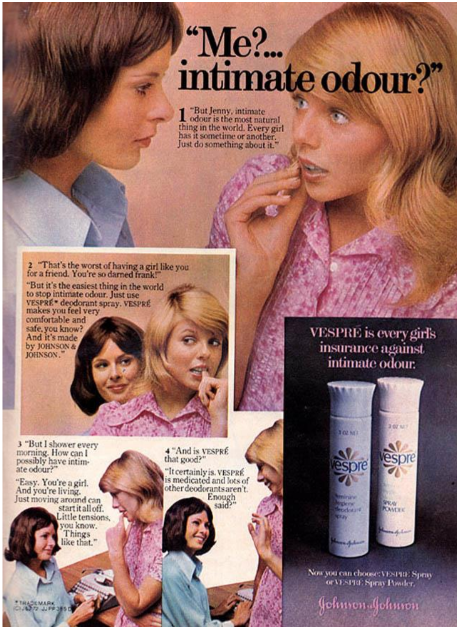
Johnson & Johnson, Vespre, c. 1970.